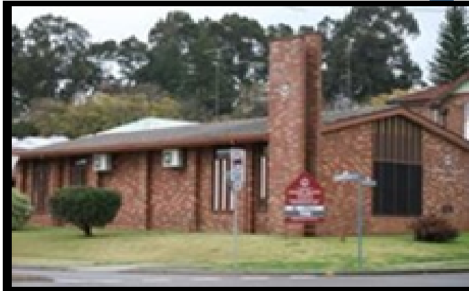
Cnr Cooper - Cumberland Sts Sunday Worship 9:30am