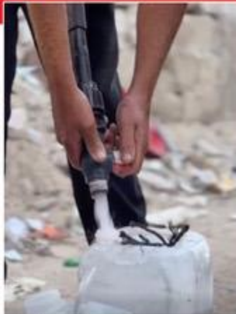
Distributing water in Gaza