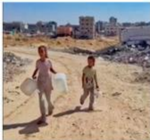
Children run to fetch water from the tanker.