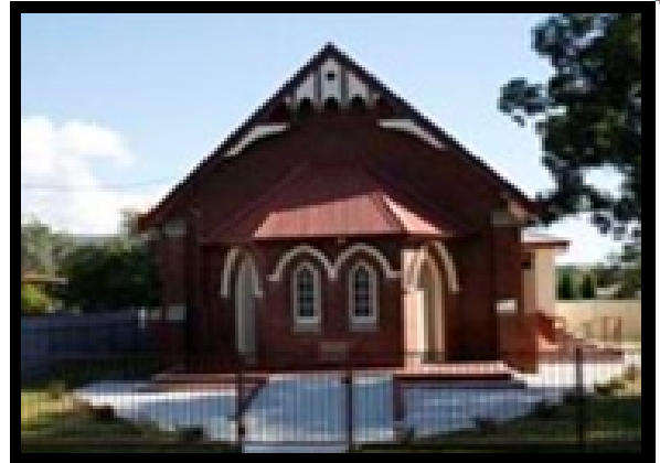
478 Wollombi Road, Bellbird.