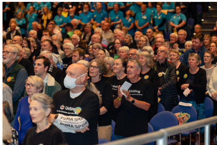
Some of the Uniting Church contingent!

Those attending and politicians alike marvelled at the unique experience of public democracy with such a positive spirit. Each organisation was individually welcomed with resounding applause invoking a sense of solidarity for the common good. Individuals shared their personal stories of struggle bringing home to politicians the urgency of the task to bring about changes that have real significance to the daily life of many in our region .