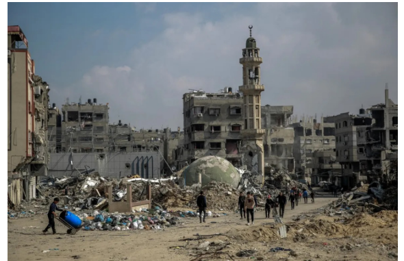
The destruction in Gaza.