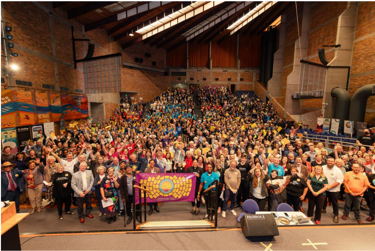
850 strong crowd representing members of 38 organisations

Those attending and politicians alike marvelled at the unique experience of public democracy with such a positive spirit. Each organisation was individually welcomed with resounding applause invoking a sense of solidarity for the common good. Individuals shared their personal stories of struggle bringing home to politicians the urgency of the task to bring about changes that have real significance to the daily life of many in our region .