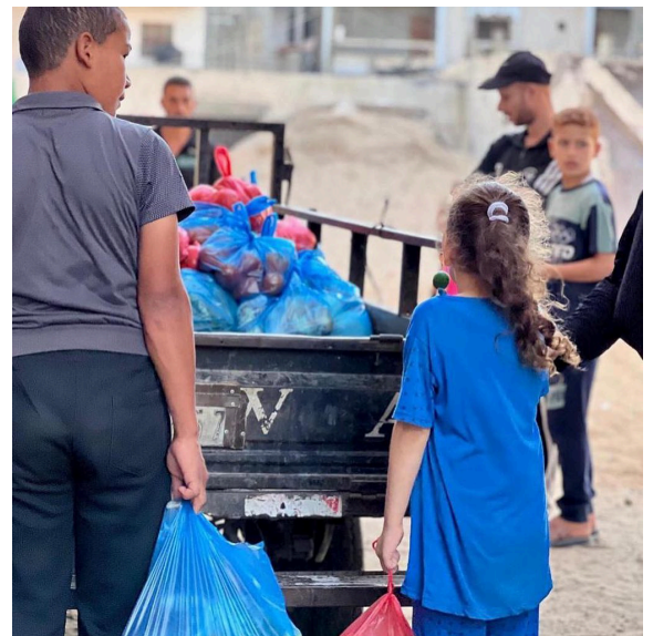
Food distribution in Gaza by the UK charity, Refugee Biryani and Bananas.