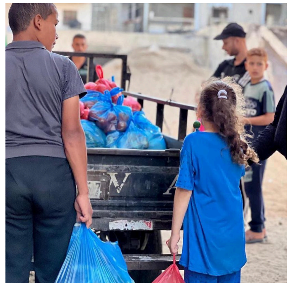
Food distribution in Gaza by the UK charity, Refugee Biryani and Bananas.